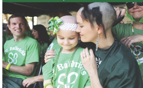
The Auburn Fire Fighters and The Knights of Columbus 7th Annual St. Baldrick's Head Shaving Event. www.stbaldricks.org/events/AuburnFire2018

Rock the Bald St. Baldrick's FOUNDATION Conquer Childhood Cancers