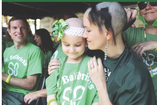
The Auburn Fire Fighters and The Knights of Columbus 7th Annual St. Baldrick's Head Shaving Event.

www.stbaldricks.org/events/AuburnFire2018